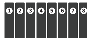
INTELLIGENT INK SUPPLY SYSTEM

8 channels, Ink shortage alarm function.